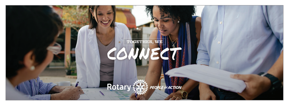
1600px x 550px — Digital banner

Digital ads, such as banners (horizontal ads) or skyscrapers (vertical ads), should be used for your club and district websites. Don't forget to balance and align everything the same way you would any ad.