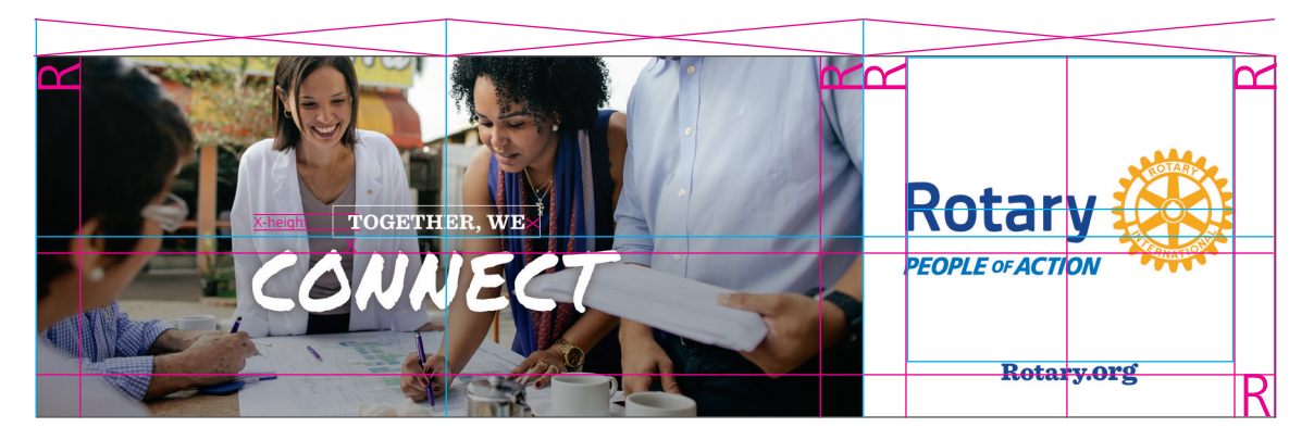
X-height (represented by a capital "X")