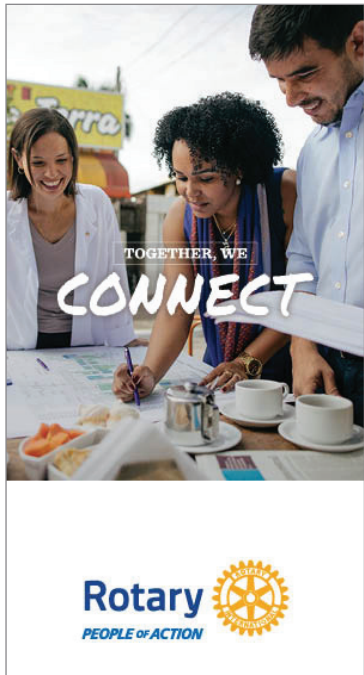
300px x 600px — Skyscraper

For more information on creating digital ads, please refer to the People of Action Campaign Guidelines, which you can download from the Brand Center .