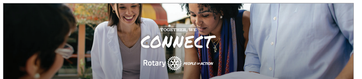
1600px x 350px — Digital banner