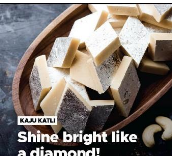
KAJU KATLI Shine bright like a diamond!

Don't underestimate yourself. The softest of people can withstand great pressure.