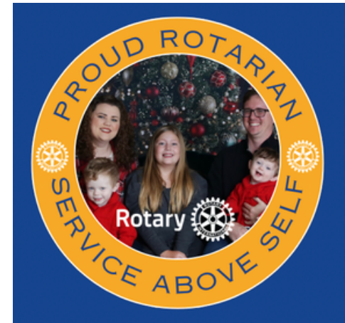
FACEBOOK PROFILE PHOTOS